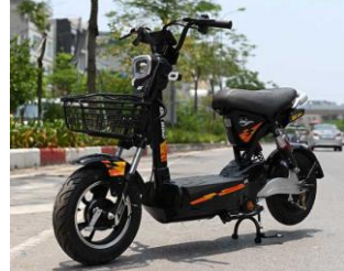
A5) DK 133M