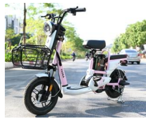
A6) Yadea iGo