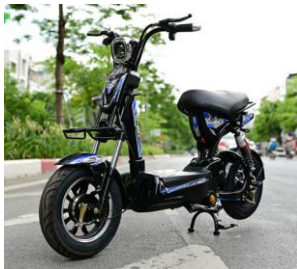
A1) M133 mini

Table 1 presents the criteria of each electric bicycle type [43].