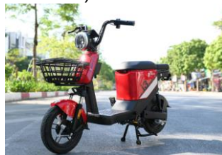
A7) Yadea i3