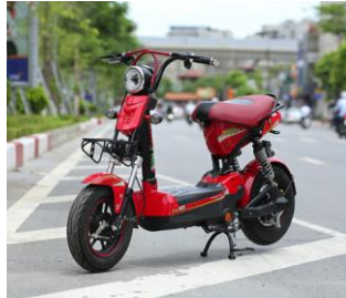
A2) M133 Sport 2022