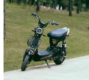
A3) Aima 133AM